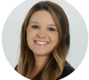
Public Health Educator

Thinking about quitting smoking? Celebrate Healthy Lung Month by making a quit attempt. Quitting smoking can not only improve long-term lung health, but your overall well-being too.